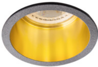
SPAG D B-G