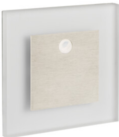
APUS LED PIR