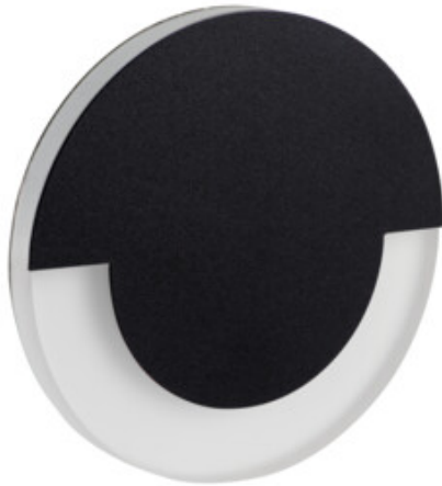
SOLA LED B