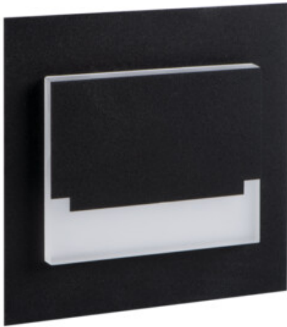
SABIK LED; SABIK LED AC