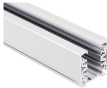
33232 TEAR N TR 2M-W

Track system component, TEAR N TR 2M-W, 3-circuit track, white, (33232)