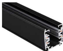
33233 TEAR N TR 2M-B

Track system component, TEAR N TR 2M-B, 3-circuit track, black, (33233)