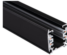
33232 TEAR N TR 2M-W

Track system component, TEAR N TR 2M-W, 3-circuit track, white, (33232)