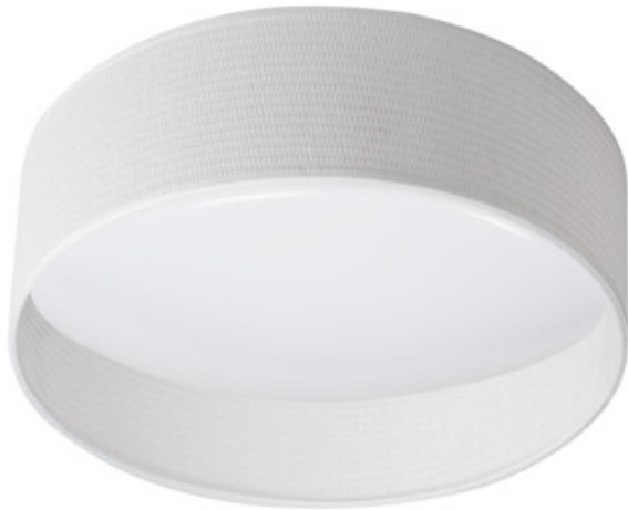
RIFA LED 17,5W N1