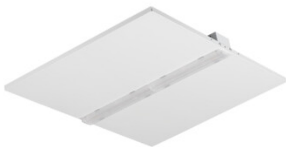
KND W P1