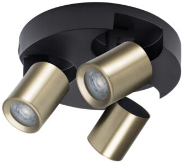
LAURIN EL-30 B-G