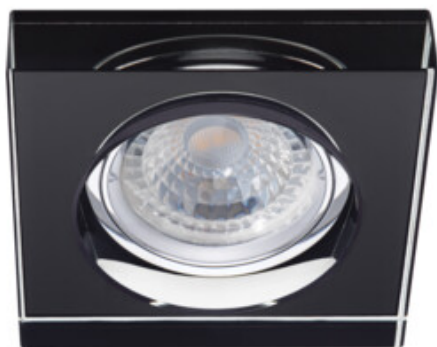
MORTA B CT-DSL50-B