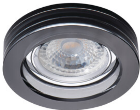
MORTA B CT-DSL50-B