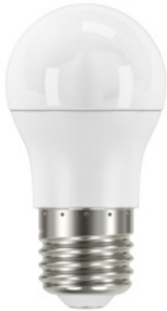
IQ-LED G45E27 7,2W